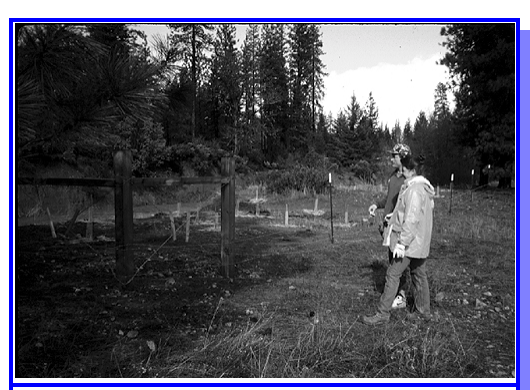
Riparian Fencing Project in Hayfork

Please contact the local NRCS office at (530) 623-3991 if you are interested in applying for a conservation project. Applications are due by March 26, 1999.