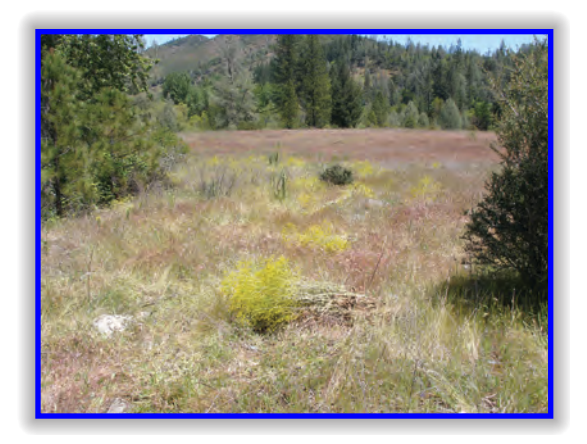
Dyer's Woad, Junction City