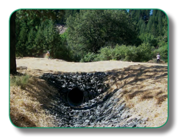
Chandler Pipe Upgrade-After