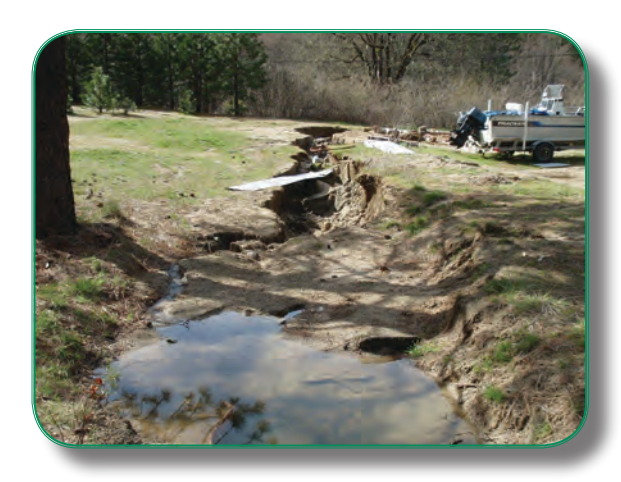
Chandler Pipe Upgrade-Before

These projects drew considerable attention to the efforts we are all making in Trinity County to protect and restore our watersheds. The grant from SWRCB helped the District obtain significant additional grant funding from other sources to continue our efforts to reduce chronic and catastrophic sediment delivery to the Trinity River and its tributaries.