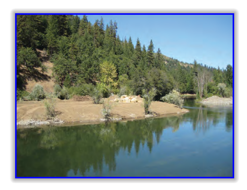
Newly constructed forced meander; previously the river traveled in a straight line, now has a significant bend.

TRRP activities are conducted in collaboration with a broad array of agencies and entities. Among these are the Trinity River Watershed Council, U.S. Fish and Wildlife Service, National Marine Fisheries Service, U.S. Forest Service, Bureau of Land Management, Hoopa Valley Tribe, Yurok Tribe, California Resources Agency and the Trinity County Resource Conservation District.