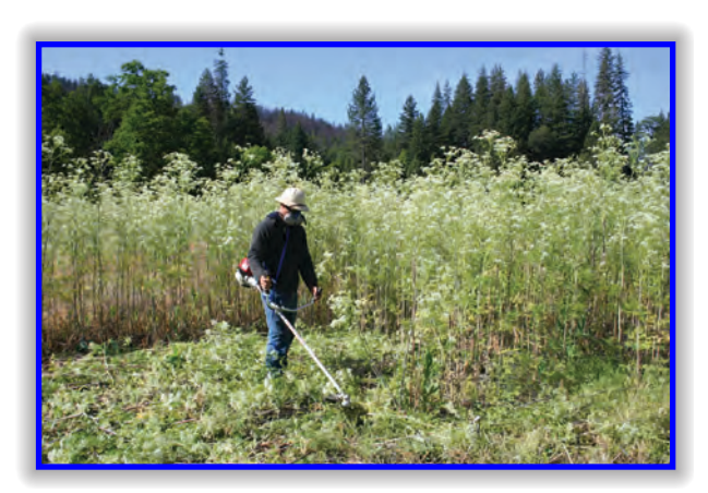
Poison Hemlock at Lowden Field