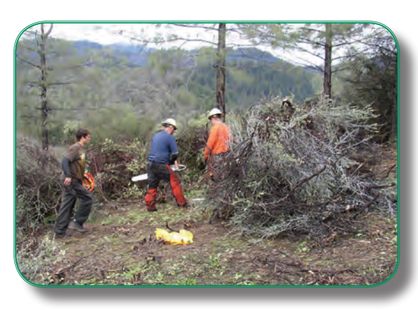
District crews clear brush

During 2010, the Trinity County Fire Safe Council focused intently on updating the countywide Community Wildfire Protection Plan (CWPP). Led by the District and the Watershed Research and Training Center, the Fire Safe Council conducted more than a dozen meetings in communities throughout the county. Volunteer fire departments hosted these meetings and many residents attended to offer their ideas on project priorities and locations. These community meetings also served as an opportunity to recognize and congratulate the 14 communities that earned their Firewise Community designation. During this time Hyampom and Willow Creek completed their local area CWPPs.