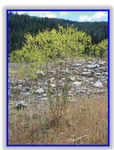
Dyer's Woad, Carrville Ponds